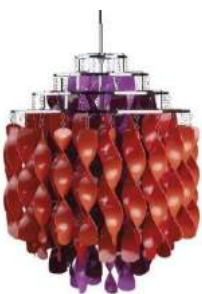
SPIRAL SP01 Design: Verner Panton, 1969

Ø45 cm / H: 60 cm Pendant with coloured spirals on four ring metal frame. Spirals are connected to the frame with small metal rings. Chrome ceiling canopy (incl.) Cord: 400 cm black fabric Light source: 220V E27 max. 75W