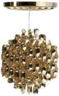
SPIRAL SP1 Design: Verner Panton, 1969

Ø48 cm / H: 115 cm Hanging lamp with one cluster of gold spirals suspended in nylon strings. Gilded ceiling plate (incl). Cord: Transparent Light source: 220V E27 max. 100W