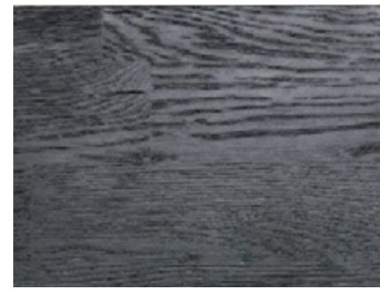
Oak, wire brushed