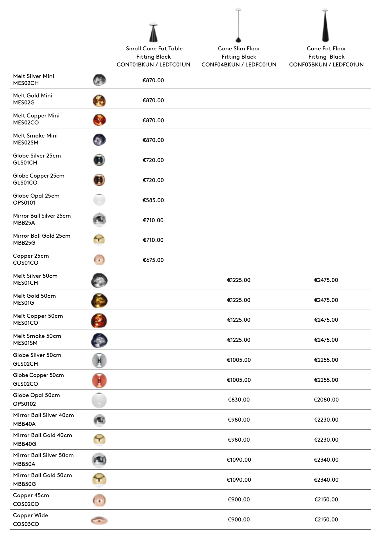
TABLE & FLOOR

For ordering process please contact Customer Services for more information