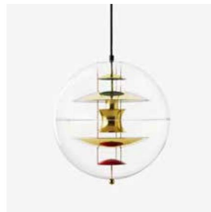
VP Globe Brass