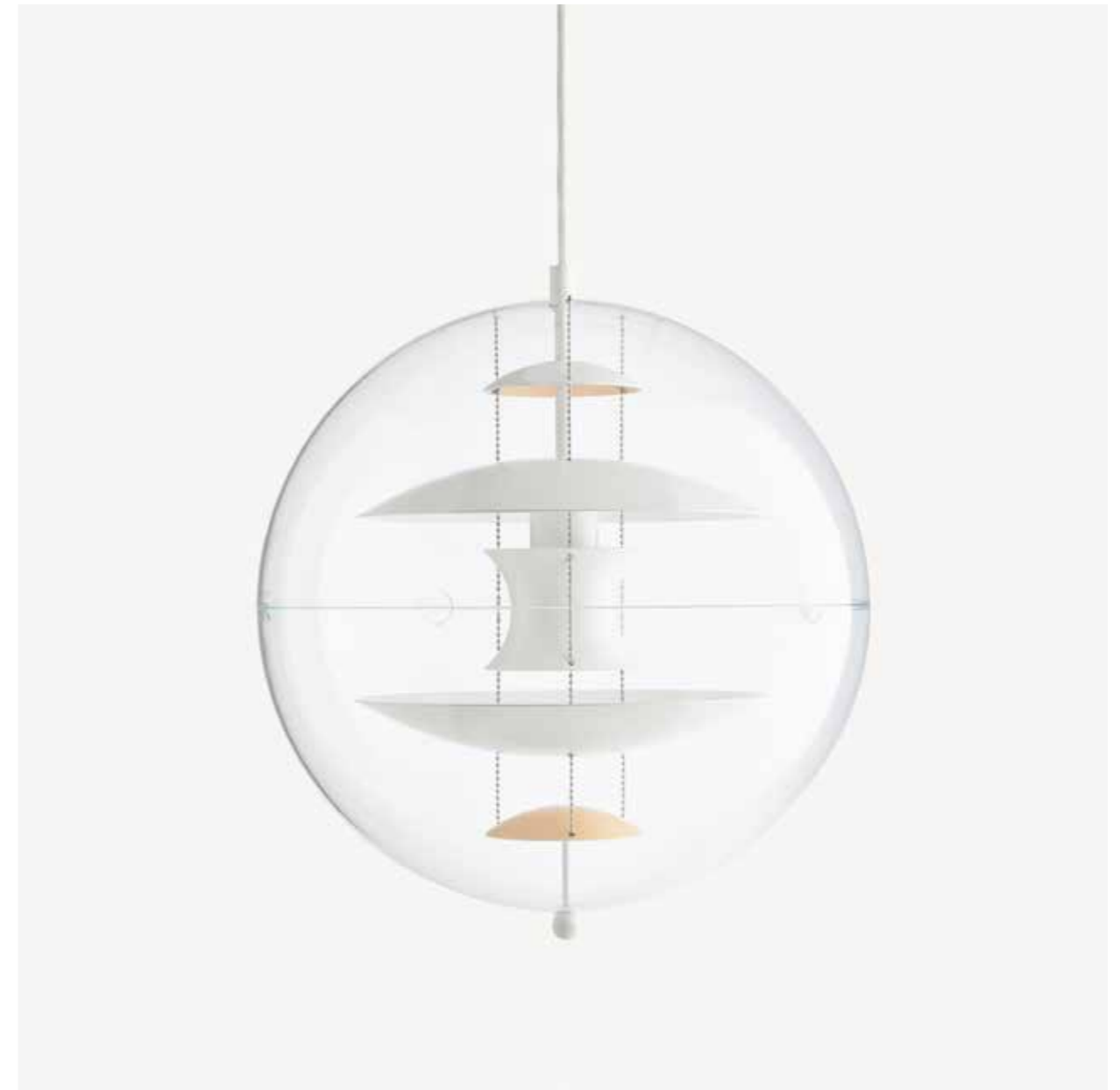
VP Globe Warm Peach