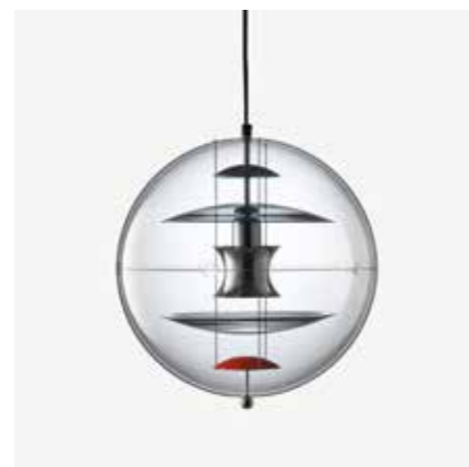
VP Globe Coloured Glass