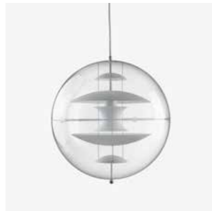
VP Globe Glass